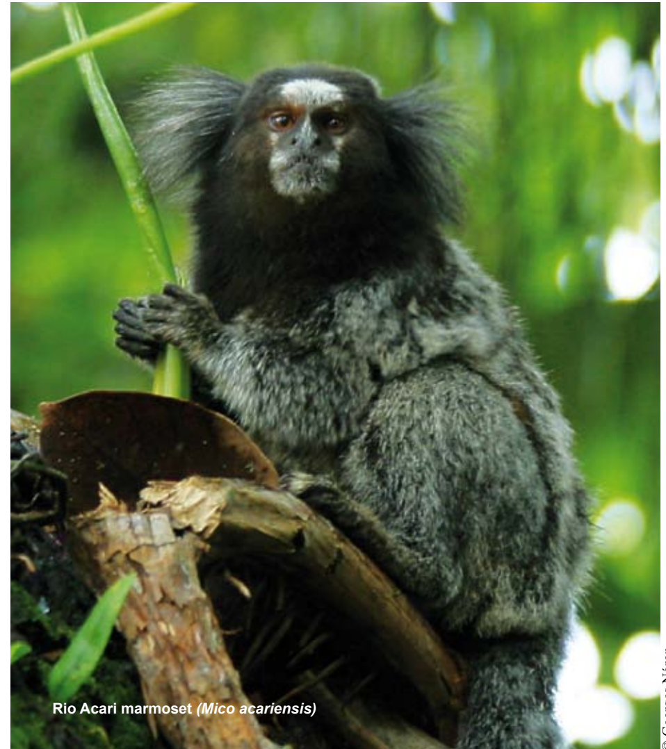
Rio Acari marmoset ( Mico acariensis )

Seven new monkey species were also discovered during the period. An inhabitant of the lowland Amazon rainforest, the Rio Acari marmoset ( Mico acariensis ), discovered in 2000, is a marmoset species endemic to Brazil 68 . It was originally being kept as a pet by inhabitants of a small settlement near the Rio Acari, in central Amazonia, Brazil. The species weighs 420g, is 24cm tall, with a total length of 35cm, and it has a striking bright orange coloration of its lower back, body underparts, legs and tail base. This species occurs in a relatively remote region of the Amazon, away from major human disturbance. It has not been studied in the wild, and there is currently no reliable information on its population status or major threats.