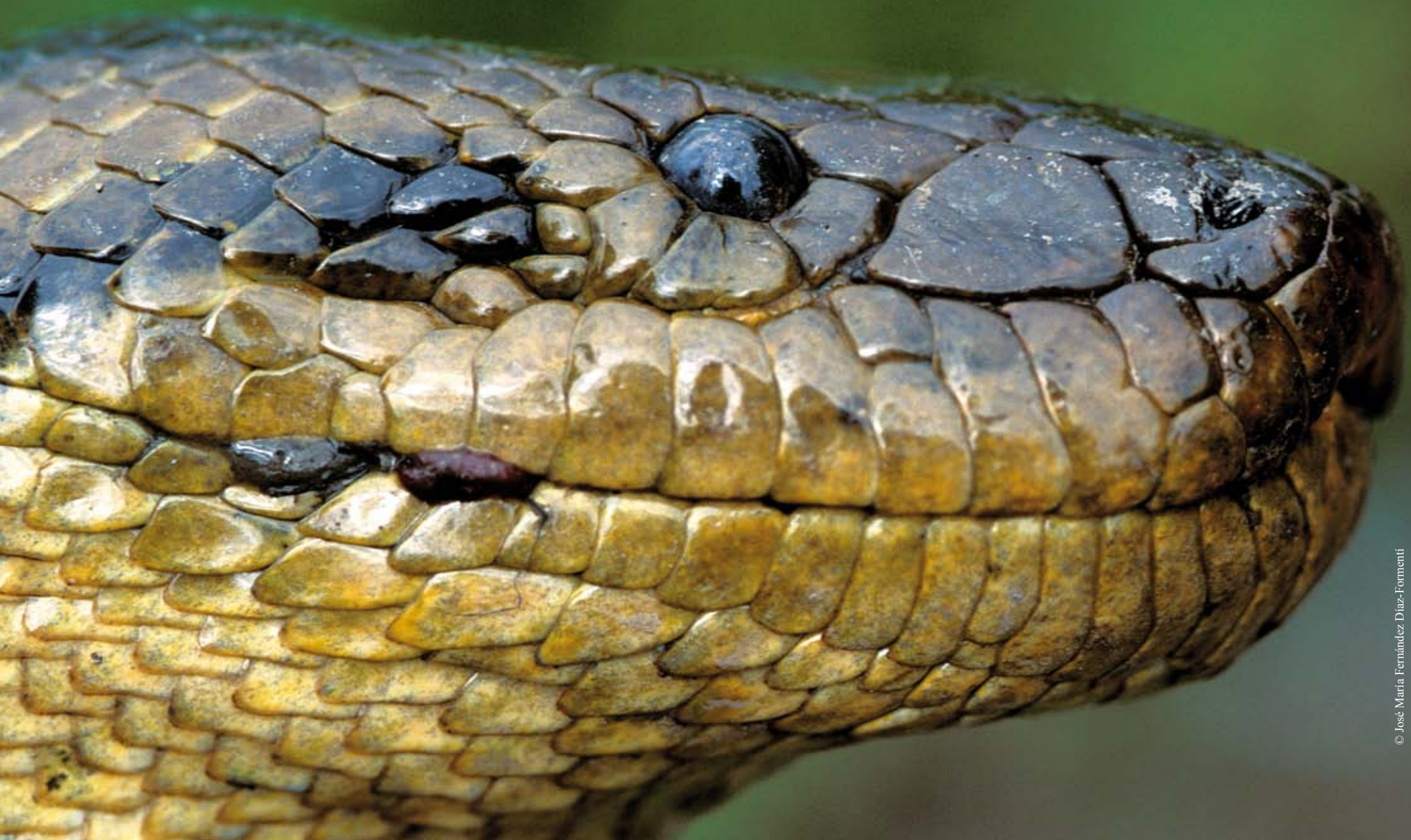
Bolivian anaconda ( Eunectes beniensis )