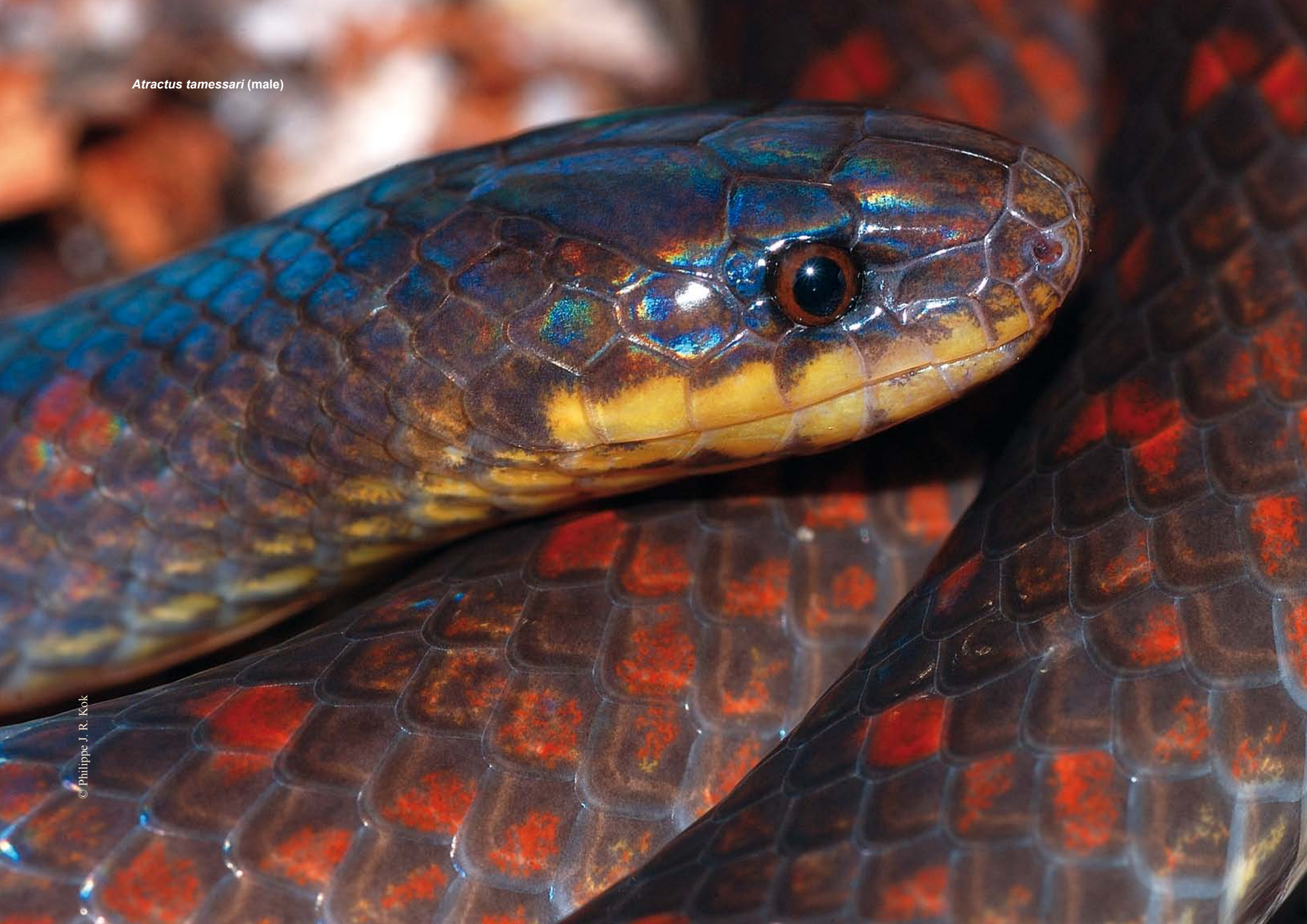
Atractus tamessari (male)