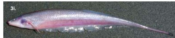
3a. Otocinclus cocama 3b. Apistogramma baenschi 3c. Apistogramma baenschi 3d. Compsaraia samueli 3e. Hypancistrus contradens 3f. Brachyplatystoma capapretum 3g. Aphyocharax yekwanae 3h. Phreatobius dracunculus 3i. Compsaraia samueli