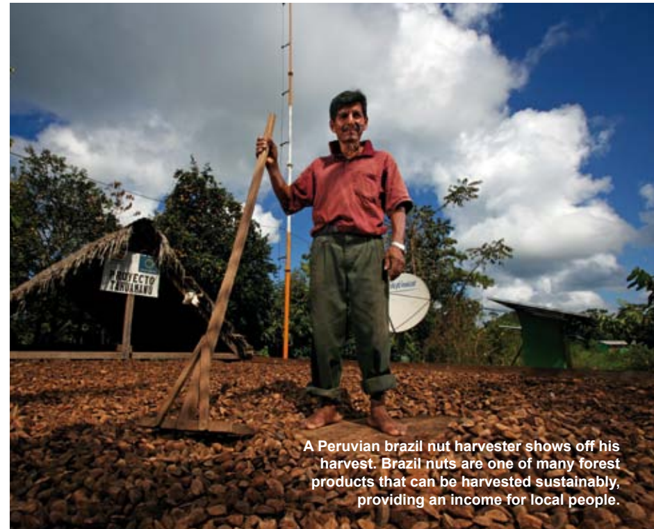
A Peruvian Brazil nut harvester shows off his harvest. Brazil nuts are one of many forest products that can be harvested sustainably, providing an income for local people.

In 2009, the Brazilian government announced that the rate of deforestation in the Amazon had dropped by 45%, and was the lowest on record since monitoring began 21 years ago. According to the latest annual figures, just over 7,000 sq km was destroyed between July 2008 and August 2009, compared with the previous year's 12,911 sq km. Furthermore, the Brazilian government's climate change policy includes a commitment to reduce deforestation in the Amazon by 80% between 2006 and 2020.