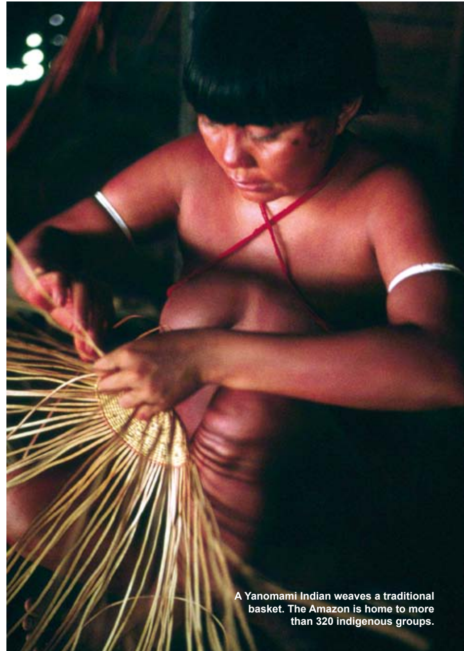
A Yanomami Indian weaves a traditional basket. The Amazon is home to more than 320 indigenous groups.

In the Amazon, the whole is more than the sum of its parts, and the development of a vision for conservation will help maintain the integrity, functionality and resilience of the Amazon, now faced with growing threats, particularly climate change.