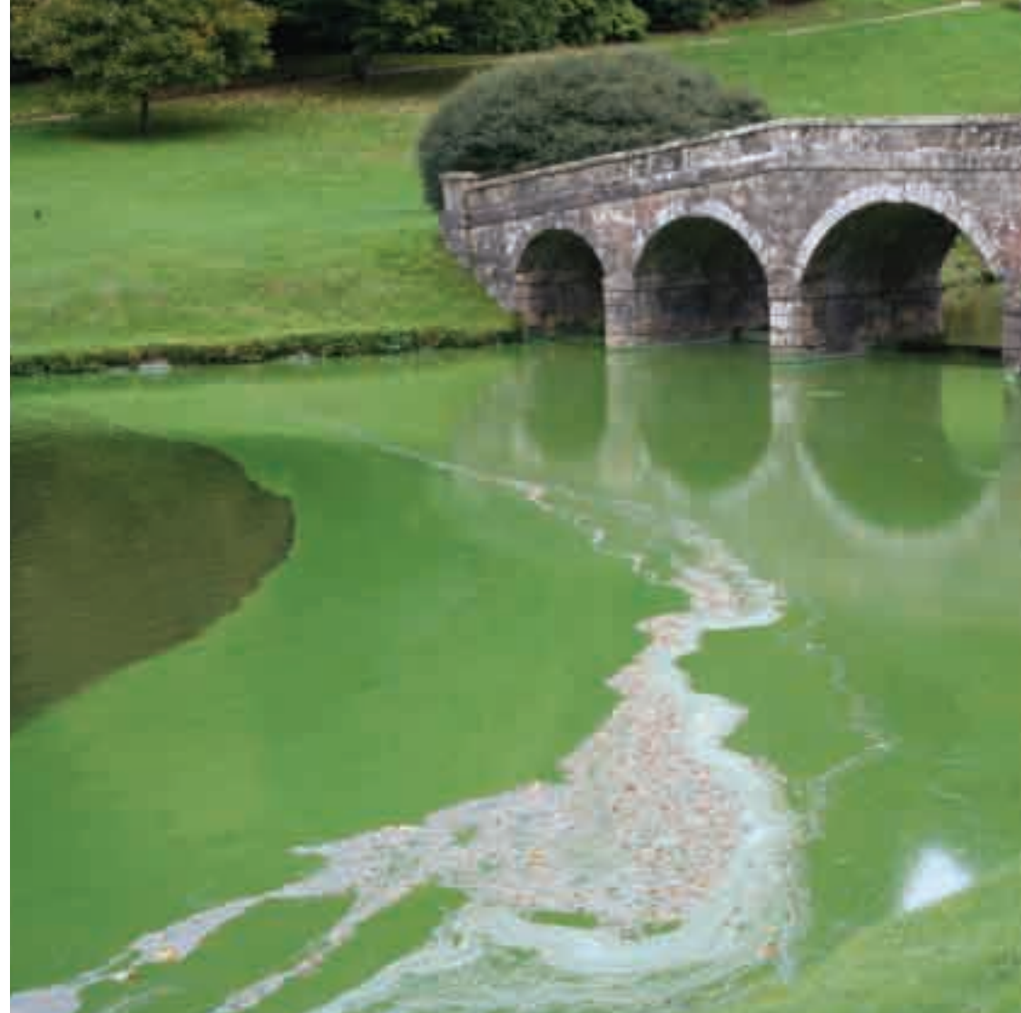
An example of algal bloom at Stourhead, Wiltshire

As a result of environmental damage, over 70% of our rivers are failing to support a sustainable population of SALMON