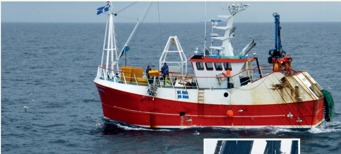
■ What a waste. Up to half the fish caught in Europe are thrown back dead.