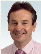
■ MEP Chris Davies

A new cross-party campaign group of Members of the European Parliament (MEPs) has been formed to ensure that a radical reform of the EU fisheries policy is possible. The 'Fish for the Future' group has already gained support from MEPs in 4 countries representing all the major political groups in the European Parliament. The Group has drafted a written declaration calling on the European Commission to adopt a "long-term, regionally-sensitive, science-led approach" to reform the Common Fisheries Policy. In some areas this may require a temporary reduction in the amount of fish caught. MEP Chris Davies, who started the group, said: "Our seas are capable of supporting many more fish than now exist after so much overfishing. We cannot allow the agenda to be set by short term thinking that ignores the need to ensure that we have fish on the table in 50 or 100 years' time." For more information: chris.davies-office@europa.eu , +32 228 373 53