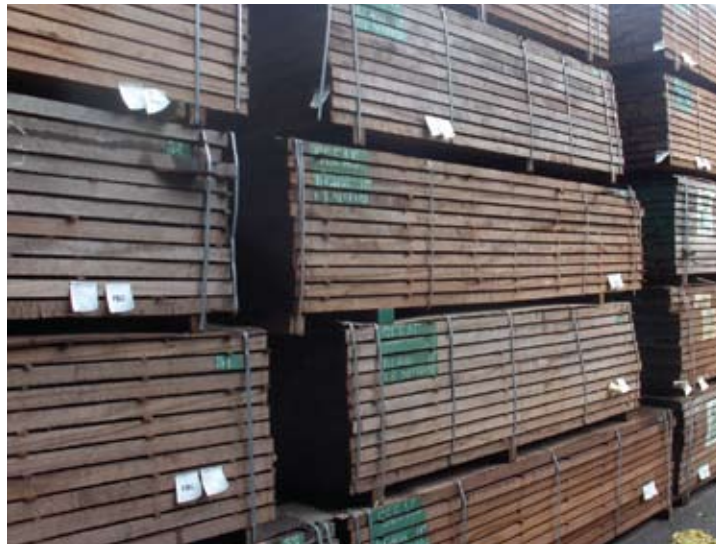
Photo showing FSC Sapele from SEFAC and CIB

This progress involves International Timber, the Group's specialist timber importing and distribution business which operates from five sites in the UK, and Jewson, the Group's timber and builders' merchant chain which has more than 500 trade branches nationwide. Jewson also has two large