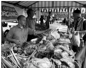
Supporting your local farmers' market is one key way to reduce your food footprint

On a personal level, we can all be more sustainable – by switching to a renewable electricity supplier, by consuming less, by being energy-efficient and by cutting back on our car use. Our individual actions can make a difference!