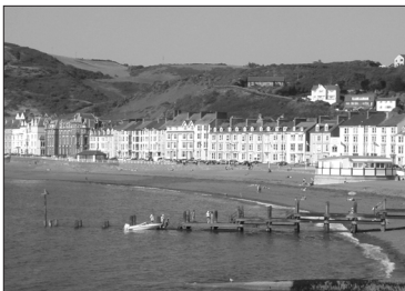
Aberystwyth sea front: WWF Cymru is calling for a Marine Act to better protect Wales' stunning coast and amazing marine wildlife

For as little as £3 a month you can help support our vital work to ensure a healthy future for people and nature. Call 01483 426 333 to join.