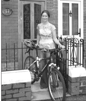
Walking more and cycling are not only healthier – they will reduce your impact on the Planet

The rich Western nations use 58% of global energy production and own 92% of the world's private cars, but account for just 20% of the population. There are still two billion people living with no household electricity or telephone and the poorest 20% of the world's population meet their energy needs by cutting down trees more quickly than they plant them.