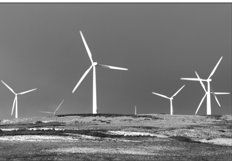
Cynhyrchu trydan o ffynonellau adnewyddadwy fel y fferm wynt hon yw un ffordd y gallwn fyw'n fwy cynaliadwy

Mae'r ffeithiau'n syfrdanol. Rydym yn colli ein coedwigoedd naturiol fesul 30 erw'r funud. Rydym yn pwmpio 160 biliwn o fetrau ciwbig o ddw'r daear yn fwy na'r gyfradd ail-lenwi naturiol. Mae 70 y cant o