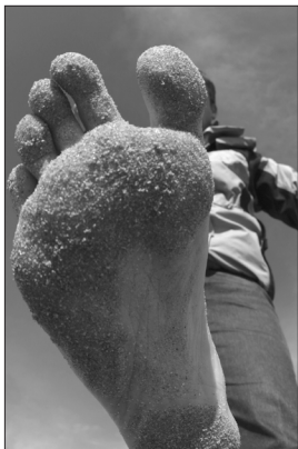
Gwnewch ein cwis i fesur eich ôl troed

I fesur eich ôl troed yn fwy cywir ewch i http://footprint.wwf.org.uk a rhowch gynnig ar gyfrifiannell ôl troed newydd WWF.