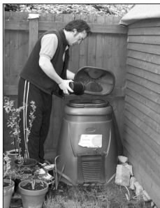
Bydd compostio ein gwastraff bwyd yn lleihau eich ôl troed ecolegol

Os cymerwn ni i gyd ychydig o gamau bach gyda'n gilydd, bydd hynny'n naid fawr tuag at fyw'n fwy cynaliadwy. Peidiwch â chael eich digalonni gan faint y problemau – gallwn ni i gyd fod yn rhan o'r ateb. Y peth pwysig yw i ni beidio ag oedi a'n bod gyda'n gilydd yn dechrau lleihau ein heffaith ar adnoddau'r Ddaear heddiw.