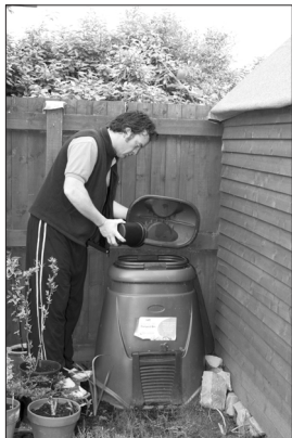
Composting our food waste will reduce your ecological footprint

If we all start to take a few small steps it will soon add up to a giant leap towards more sustainable living. Don't be daunted by the scale of the problems – we can all be a part of the solution. The important thing is that we don't delay and that together we begin to reduce our impact on the Earth's resources today.