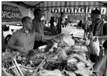
Cefnogi'ch marchnad ffermwyr leol yw un ffordd allweddol o leihau'ch ôl troed bwyd

Ar lefel bersonol, gallwn ni i gyd fod yn fwy cynaliadwy – trwy newid i gyflenwr trydan adnewyddadwy, trwy ddefnyddio llai, trwy fod yn ynni-ffeithlon a thrwy ddefnyddio ceir llai. Gall ein gweithredoedd unigol wneud gwahaniaeth!