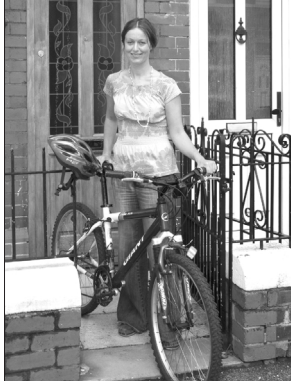
Nid yn unig mae cerdded mwy a beicio'n iachach – byddant yn lleihau'ch effaith ar y planed

Mae cenhedloedd cyfoethog y Gorllewin yn defnyddio 58 y cant o gynhyrchiant ynni'r byd ac yn berchen ar 92 y cant o geir preifat y byd, ond dim ond 20 y cant o'r boblogaeth sy'n byw ynddynt. Mae 2 biliwn o bobl yn dal i fyw heb drydan na ffôn yn eu tai ac mae'r 20 y cant tlotaf o boblogaeth y byd yn diwallu eu hanghenion am ynni trwy dorri coed yn gyflymach nag y maent yn eu plannu.