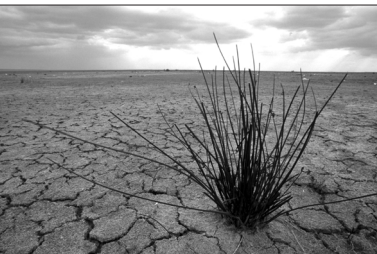
Parched land due to drought in the 'Sebkhra de Kelbia' lagoon in Tunisia

be swamped by the sea and lost. Cities like New York and London are also under threat.