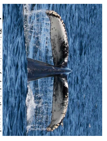
This species of whale is the camel of the sea!