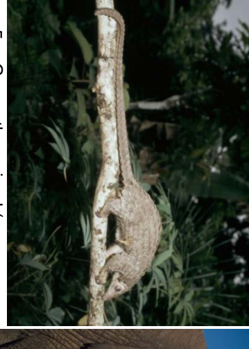
Ò Guess the animal (common name)