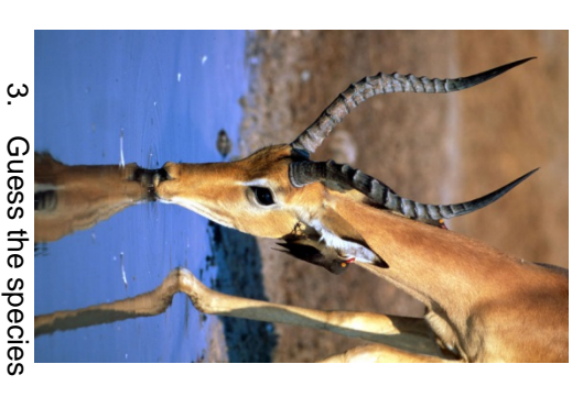
Guess the species (common name)