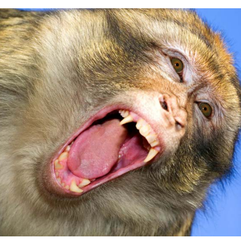
Guess the primate (common name)