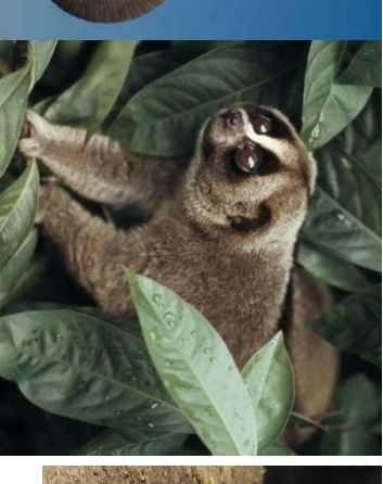
for its speed... This primate is not famed