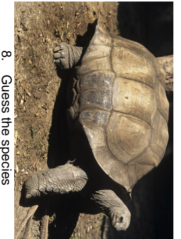
Guess the species