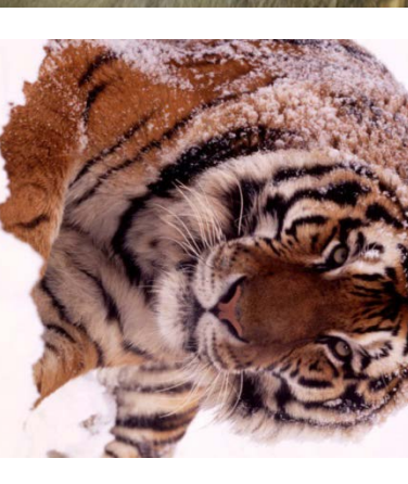
Tiger - Bengal, Amur or Sumatran?